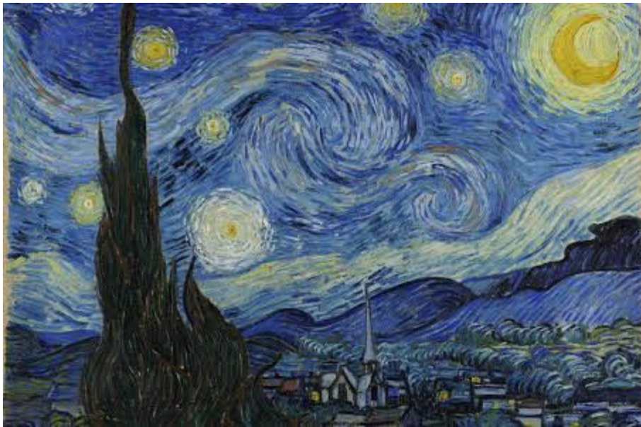
Starry Night by van Gogh, 1889

https://www.youtube.com/watch?v=qv8TANh8djl